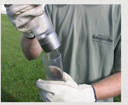
DT325 Liner Spacer Refill (29609) DT325 Liner Spacer Head (29358)

The new DT325 Liner Spacer Refill (PVC) and Liner Spacer Head is recommended for flowing soils which may overfill liners during normal sampling procedures. The extra room afforded by the spacer refill keeps the system operating more smoothly and cleanly by preventing stuck liners and preventing clogged drive heads or inner probe rods.