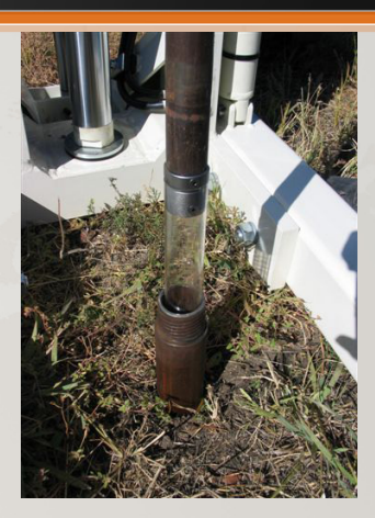
Use with 1.25 in. Light-Weight Center Rods. 68% less weight than regular 1.25 in. probe rods.