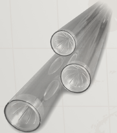
DT22 Liners with Core Catchers