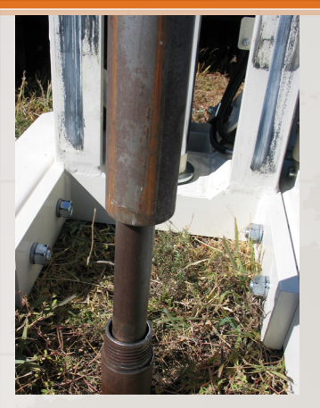
When sampling with the DT22 system, the smaller OD probe rods are placed inside the outer casing and hold a sample liner in place as the outer casing is driven one sampling interval.