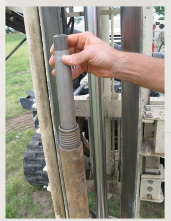
DT22 Drive Cushion (42236)