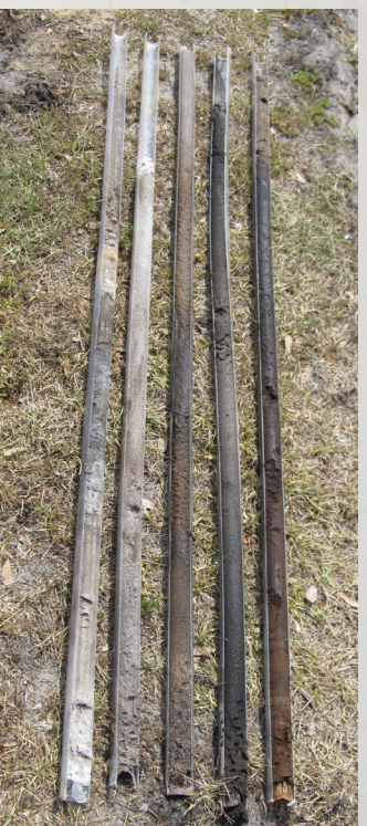
DT22 Soil Samples 60 in. Length