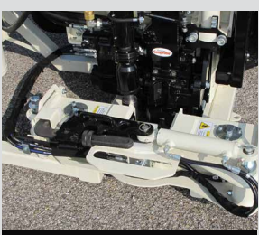
7-in. Breakout Kit