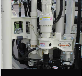
4-Speed Rotary Head

Additional drop rack, toolbox, mud pan, and other options are also available. Call us for more information.