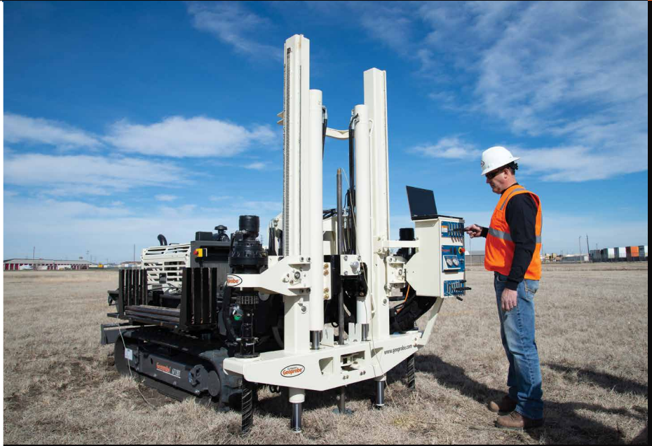
The Geoprobe® 20CPT Press mounted on a 6712DT.