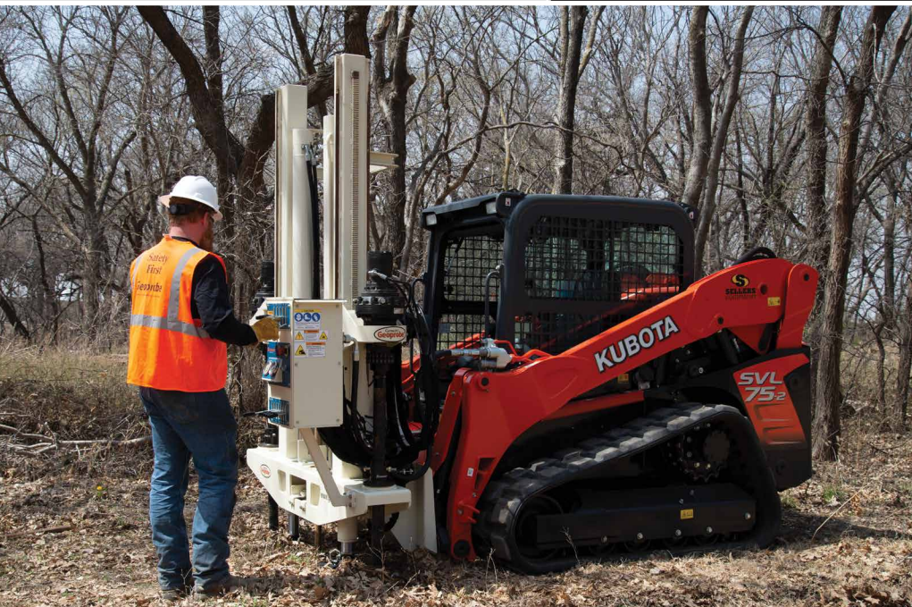
The Geoprobe® 20CPT Press mounted on a skid steer.