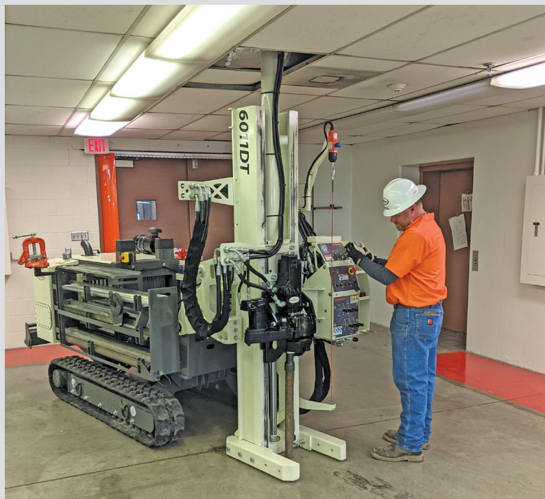
Great for indoor spaces with available low-clearance cylinder option.

Videos, Photos, Specifications, Resources