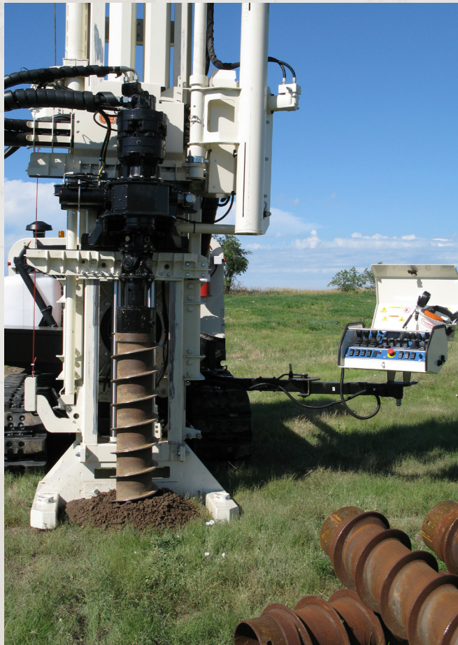
Geoprobe® 8040DT turning 8.25 in. HSA