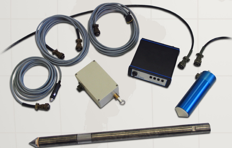
Basic components of the RW NOVA CPT system (clockwise from the left): Instrumentation Cords, Depth Encoder, Computer Interface, RW NOVA Receiver, and RW NOVA Transmitter assembled to the NOVA CPT Probe.