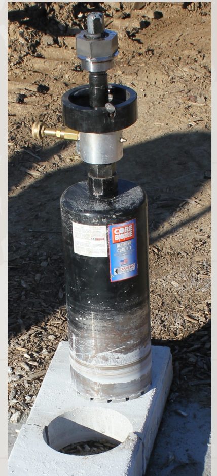
(Above) The Geoprobe® model 6620DT with a 5 in. diamond core bit using the concrete coring kit *(16840)

*The Kit Assembly (16840) is only for 54/66/77 machines - Bit not included.