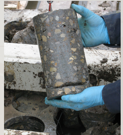
(Above) A 5 in. diameter core x 8 in. deep taken with the Concrete Coring System.