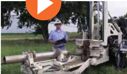
SDT60 Center Rod Guide geoprobe.com/center-guide